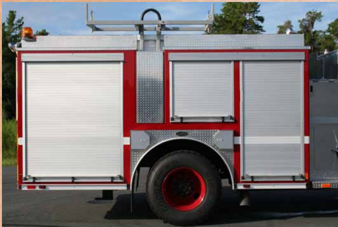
Three officer-side NFPA ladder and equipment storage options.