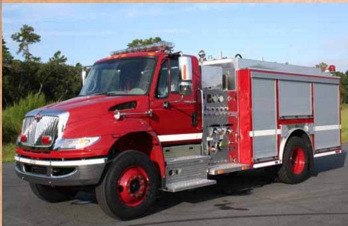
Available on a custom or commercial chassis.