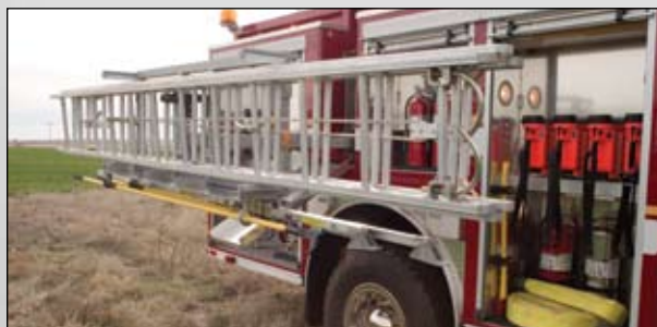
Optional drop-down or overhead ladder storage places ladders and equipment easily accessible at ground level.