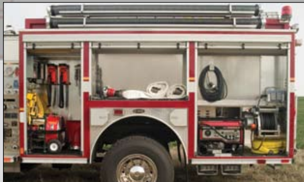
Up to 10 cu. ft. of additional compartment storage allows for multiple compartment configurations.